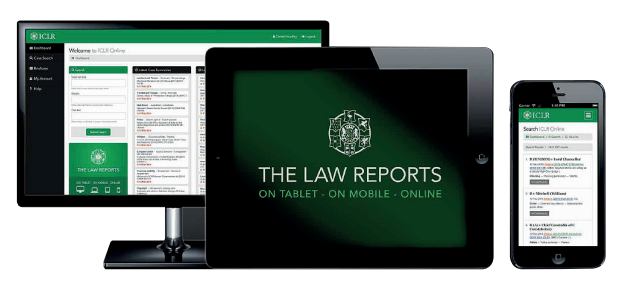
ON TABLET - ON MOBILE - ONLINE

ICLR Online gives you instant access to unlimited court-ready PDFs for all cases.